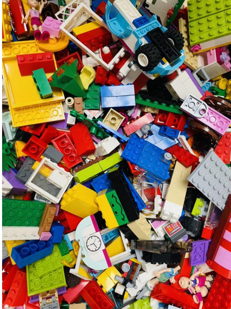
2021 Overall Winner – Theme – New Beginnings