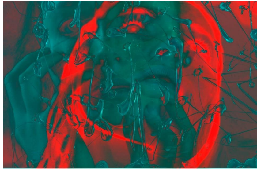
2019 Overall Winner