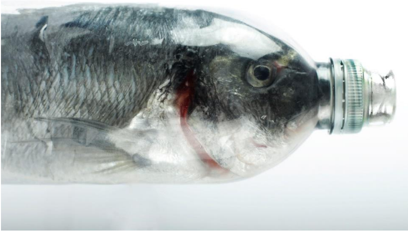
2020 Overall Winner