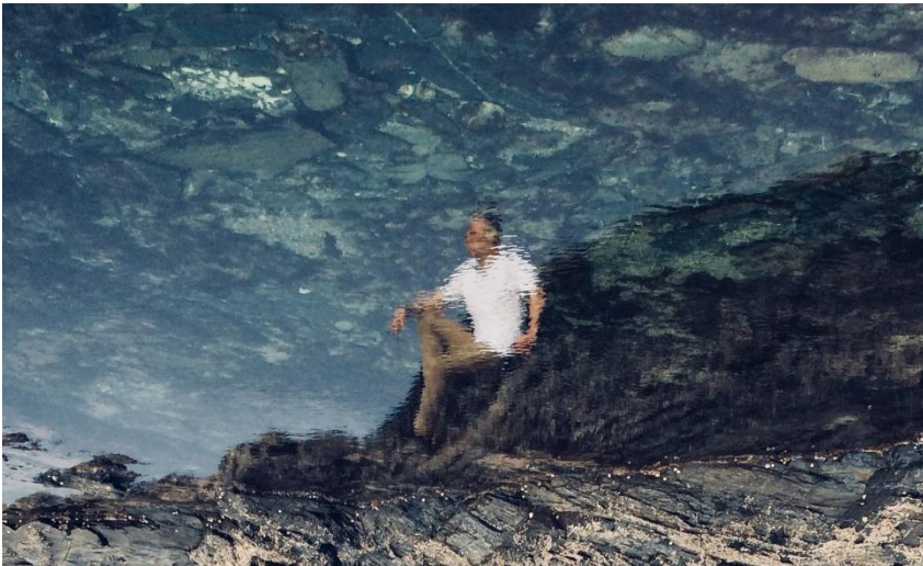
2018 Overall Winner